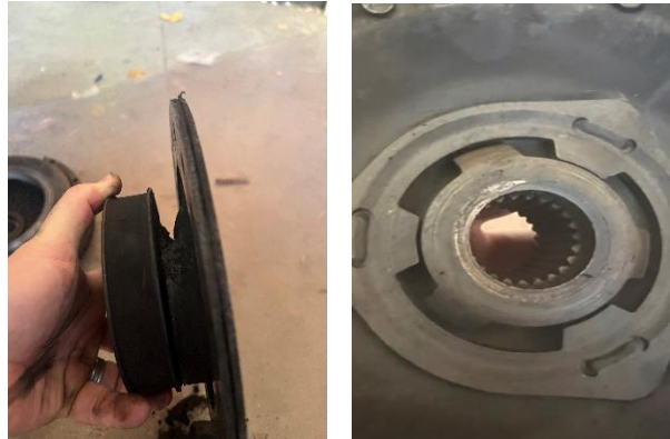
Left: The V-shaped chunk is where a good portion of the rubber clutch sheared off.

I was able to get the upper one out eventually, but there was no getting my hand in far enough to do the lower one. Luckily, among my tools is a "neunjähriges Mädchen" (nine year old girl). She was light enough to lay on a sleeping bag on the engine, and her little fingers quickly got the socket inserted.