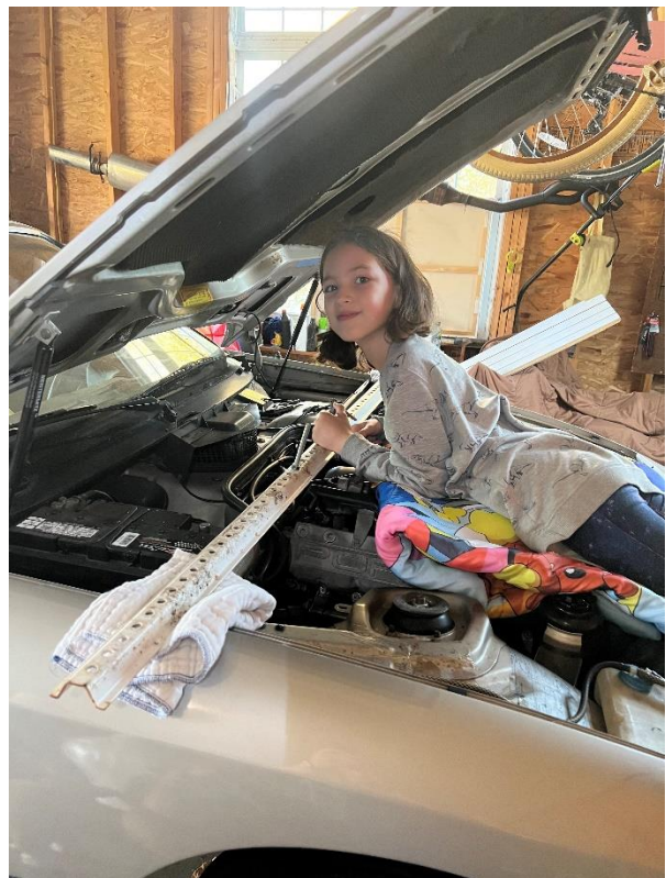
Daddy's helper. There's not much room to work on the back of a 924s engine so it helps to have someone with little hands to reach those hard to get bolts!