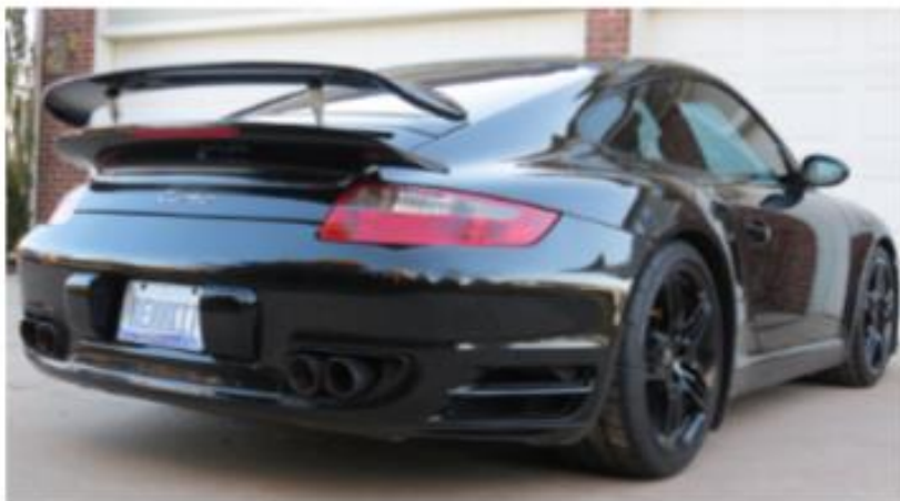
997.1 Turbo with 119 mm eRam Kit™

I wasn't up for another repair to the hydraulic system. The first fix was a messy, complex process and I knew there were multiple other potential failure points. Any repairs I did would not be permanent. What I needed was a system that did away with the hydraulics entirely. I started work on a simple, yet robust electric wing lift device that would be easy to install for the novice home mechanic.